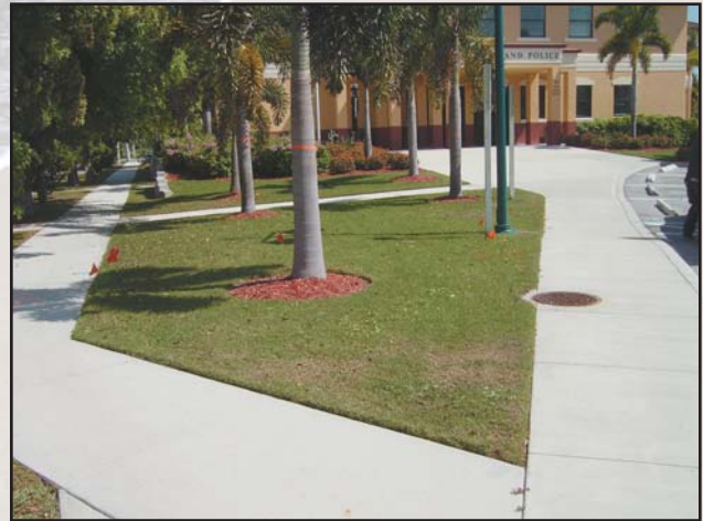
"Before" and "After" Florida Friendly Landscaping

The WSF has created a new roadway median landscape design using Florida Friendly Landscape™ (FFL) principals which means utilizing low maintenance plants and environmentally sustainable practices. FFL incorporates water conservation and emphasized pollution control