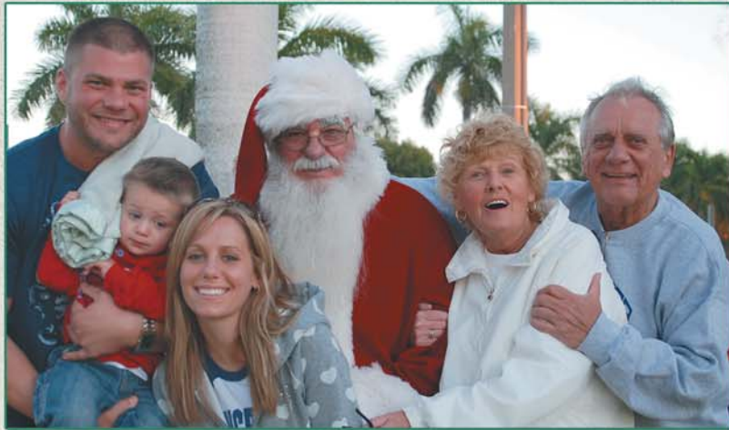
For more pictures of MICA'S 2010 Holiday Celebration see page 22