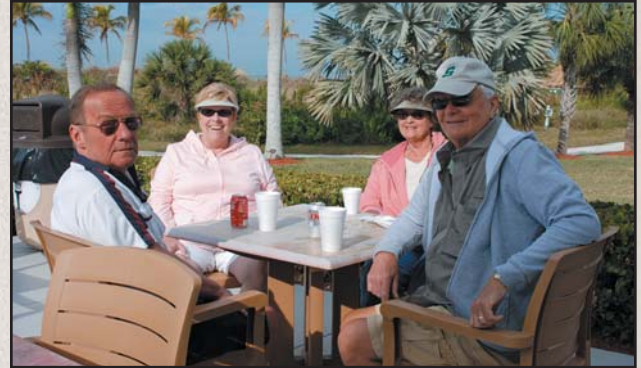
Friends enjoying morning breakfast at Paradise Grill at Residents' Beach.

The Paradise Grill has not forgotten the little ones either! The children's menu includes