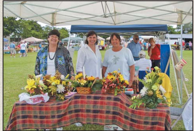
Members of the Calusa Garden Club raise scholarship funds at the Farmers' Market

Next time you drive up Winterberry stop and look for a minute and visit our newly plant-