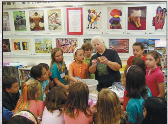
The Calusa Garden Club Junior Gardeners at Tommie Barfield Elementary School