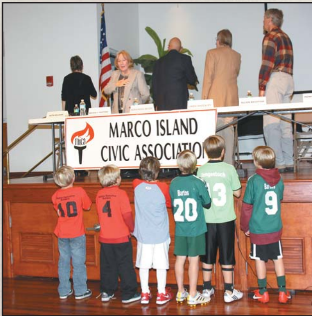
Members of the Optimist Club's soccer team lead the MICA Annual Meeting in the Pledge of Allegiance

The good hands people have figured out what MICA has been beating our drum about for 25 years. The best things in life do not cost much at all. The proof sits at the intersection of Collier Boulevard and San Marco Road and it's called the Marco Island Residents' Beach! For about .35 a day our members have one of the safest, best maintained facilities in the country.