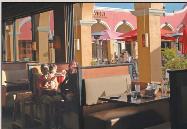
The inside is outside at Nacho Mama's when the floor to ceiling windows are opened on cool days.

The large full liquor bar is stocked with some of the finest tequilas on the island. If you like an ice cold cerveza, their beer pool is filled to the gills with 27 varieties.