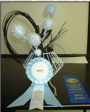
And, of course, produce a flower show. This coming year the flower show will be held on February 22-23 at the Marco Island Center for the Arts. It will be a small standard flower show entitled "Trains, Planes & Automobiles."