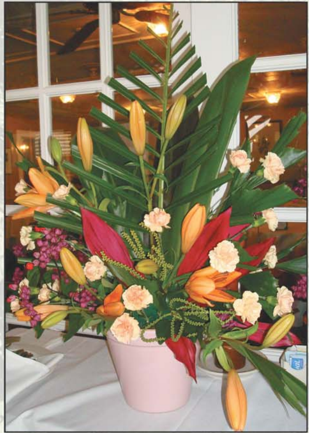
Made floral arrangements for the American Cancer Society luncheon.