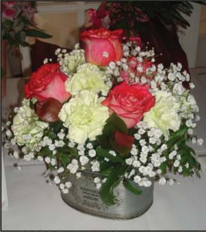
Display floral arrangements in public places.