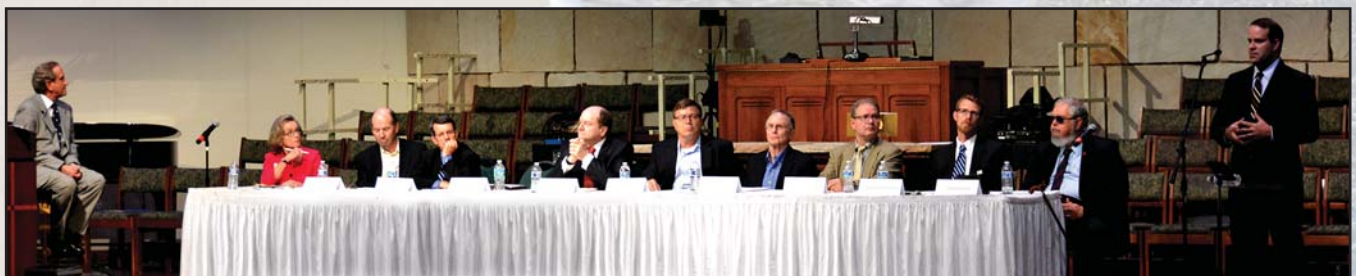
Experts outline various approaches for slowing beach erosion and replacing lost sand during Beach Renourishment Forum.