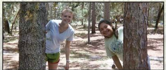
Help local children attend Camp Wekiva in Apopka, Florida.