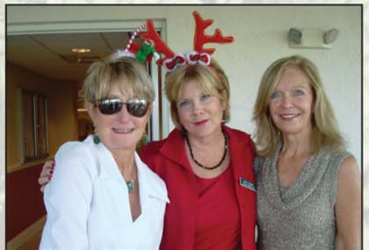
When all the work is done, Calusa Garden Club members also know how to have a good time!