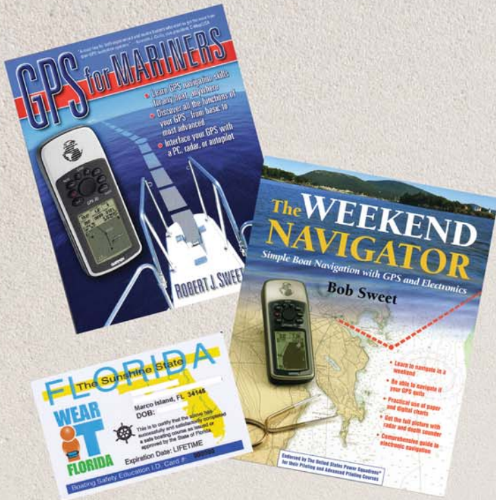
Course Materials and Florida State Boating License