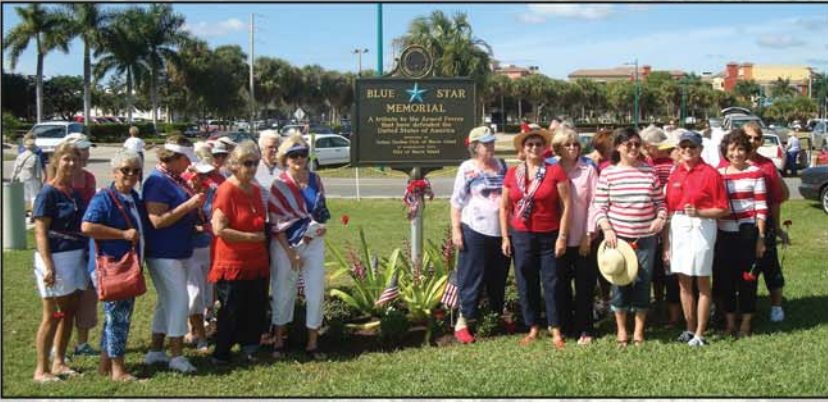
Donated the Blue Star Memorial Marker at Veterans Park.