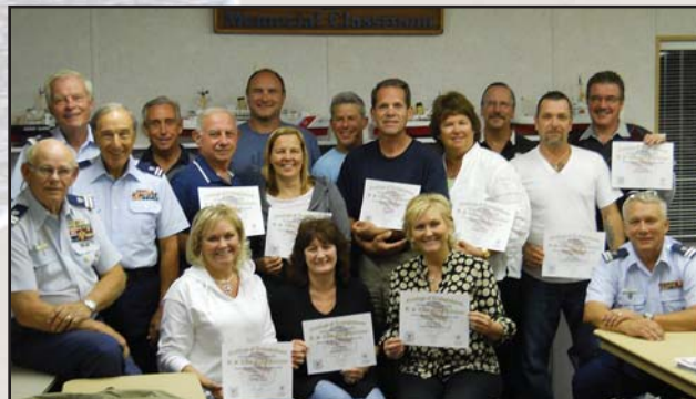
Graduates of these courses receive a Florida State Boating License

The U. S. Coast Guard Auxiliary's Boating Skills and Seamanship (BS&S) course is a comprehensive course designed for both the experienced and the novice boater. The course, now in its 14th edition published in October, 2013, consists of 8 core required two- to four-hour lessons plus five elective lessons, providing up-to-date knowledge for handling boats in all conditions.