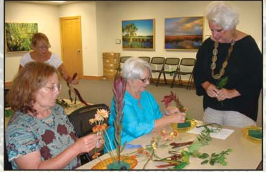
Taught a floral design class at the Marco Island Branch Library - so popular, plans are in place to have another class.