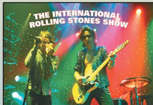
Sunday, March 24, 2013, 6-7:30 pm SATISFACTION - Tribute to The Rolling Stones

These events are for Residents' Beach members and their guests only. Please bring Residents' Beach ID, lawn chair & blanket. Paradise Grill at Residents' Beach offers a special menu!