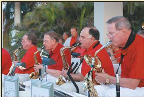
Wednesday, February 13, 2013, 5-6:30 pm Music of Marco Big Band