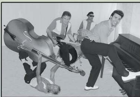
Saturday, March 9, 2013, 5-7 pm Million Dollar Quartet