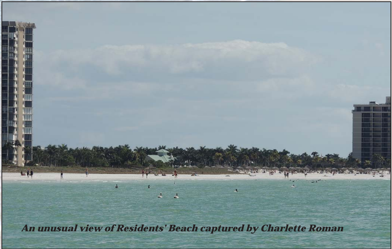
An unusual view of Residents' Beach