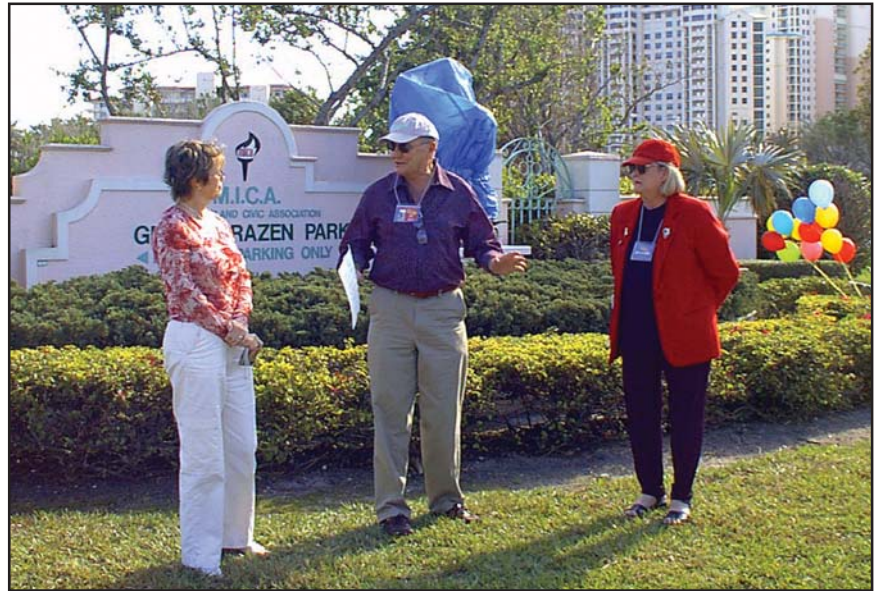
The unveiling of "It's Only a Game" in 2006

The sculptures will remain under cover until the unveilings, which will be held on November 15, 2007. Unveilings will take place at Town Center Mall with two sculptures, MICA's Residents' Beach, Orion Bank, Coast to Coast Custom Homes, Publix, and the Studio Gallery at 3 p.m., with a grand unveiling and community celebration at the Esplanade at Guy Harvey's Island Grill, Bayview Restaurant, Vergina Restaurant, FHD Interiors, Rick's Island Salon and Black Pearl Yacht Sales at 6 p.m.